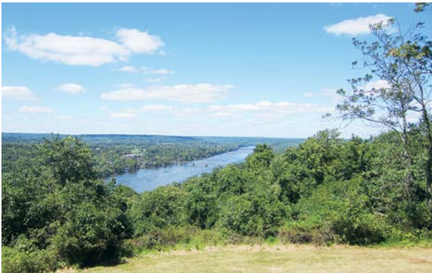
Goat Hill Overlook, Lambertville