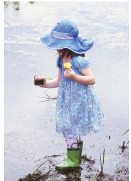
Marsh Girl in Blue

An archaeological study by Trenton-based Hunter Research found Native American artifacts, providing an important educational opportunity about the history. The Tulpehaking