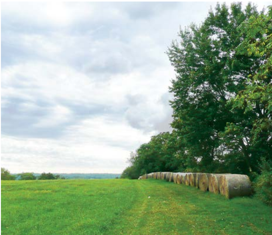
“Boondocks Farm” in Hillsborough (see page 3: Eagles Soar) preserved with Somerset County and some of the last State funding. A YES vote on November 4 will ensure we can preserve more farms and conservation lands.