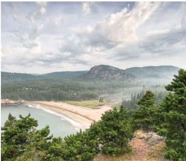
Acadia National Park (Sand Beach)