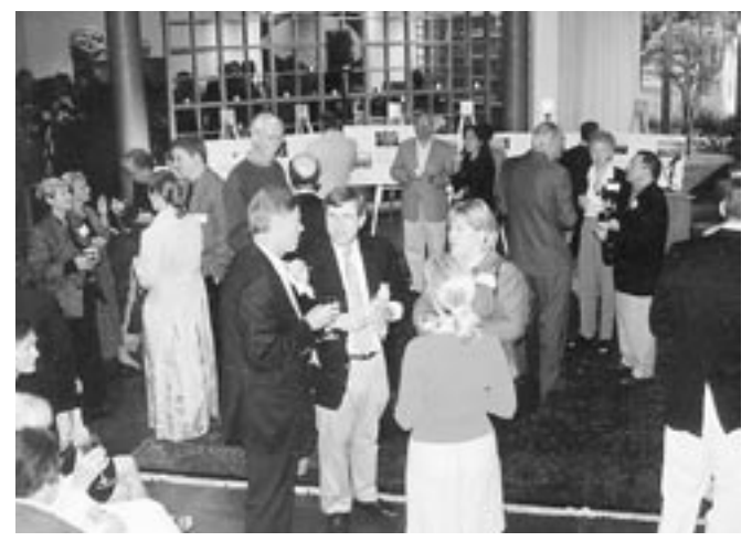
D&R Greenway's Partners in Preservation enjoying the 2004 Gala for the Greenway at the Chauncey Conference Center at ETS's Princeton campus