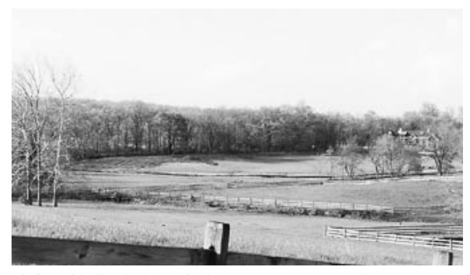
The beautiful rolling landscape of Safe Haven Farm in East Amwell.

An expansion of the existing parkland at the Hunterdon County Fairgrounds, preservation of the Ramburg property was facilitated by D&R Greenway for purchase by Hunterdon County. Consisting of two almost equal parcels totaling 81 acres, the property that adjoins Route 179 consists of open fields and will be managed for agriculture and for grassland birds. The half of the property that adjoins Gulick Road