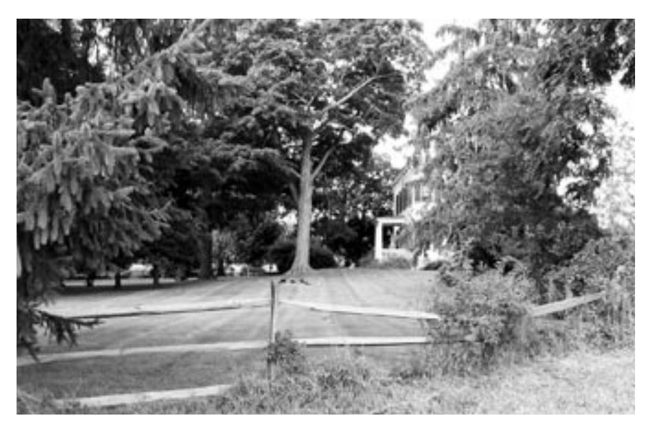
Updike Farm's historic house and surrounding land in Princeton.

D&R Greenway facilitated this transaction for The Historical Society of Princeton, helping to secure funding from both The Mercer County Open Space Preservation Board and NJDEP's Green Acres Program. The Historical Society of Princeton plans to convert the property's beautiful Federal-style farmhouse, parts of which pre-date the Revolutionary War, into its headquarters.