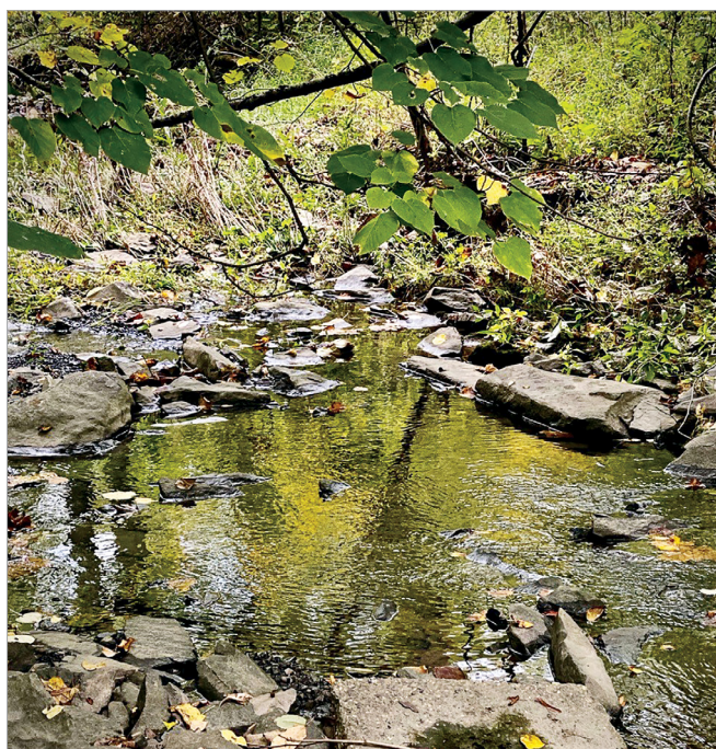
Protection of water quality is D&R Greenway's founding mission.