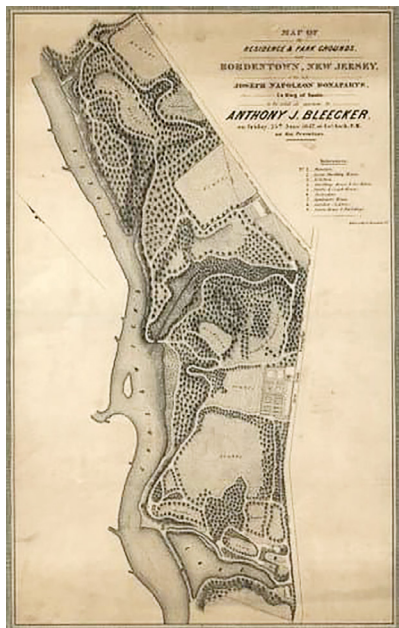
Historic map shows land, houses and gardens of Joseph Napoleon Bonaparte.

A leader who has dedicated his life to the betterment of his community, Mayor Lynch and the City of Bordentown have collaborated with us in meaningful ways for many years. The Mayor's commitment was critical to the preservation of "Point Breeze" — the former estate of Joseph Napoleon Bonaparte