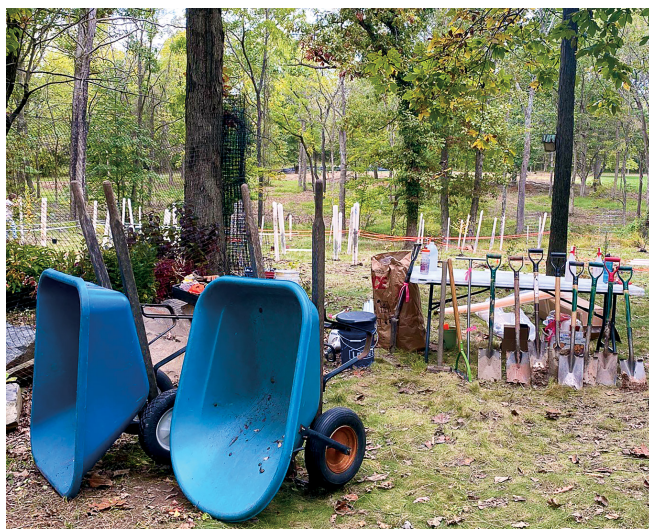
"Tools of the Trade" used by our volunteers.