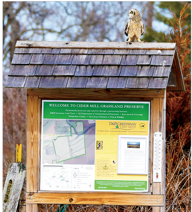
An owl "staycations" at Cider Mill Grassland Preserve.