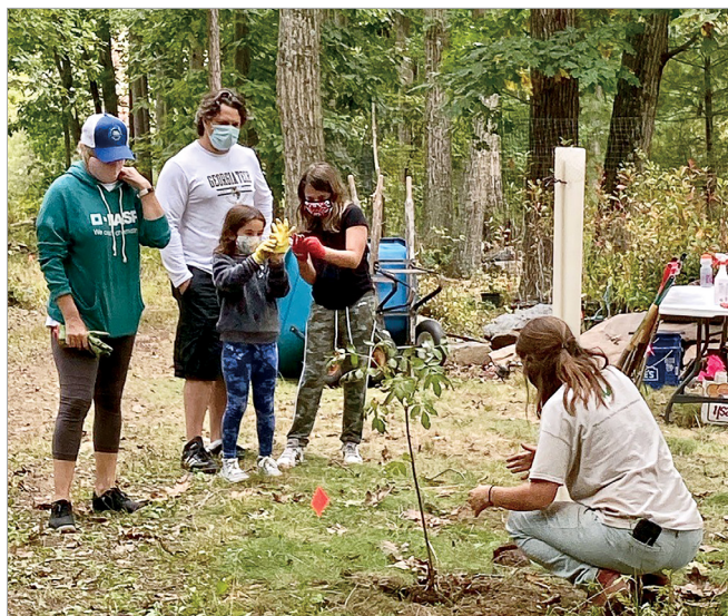
Family volunteers assisted with planting trees in 2020 to provide fresh air and healthy biodiversity.