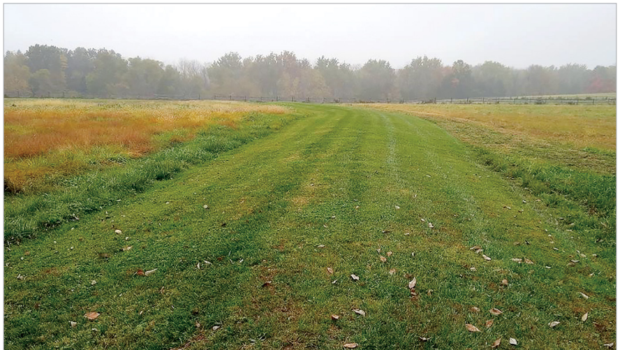
The vastness of farmland on the Cifelli family property.

We look forward to achieving great things in partnership with our loyal volunteers and donors. Look for updates and ways you can be a part of this movement — coming soon. 🌱