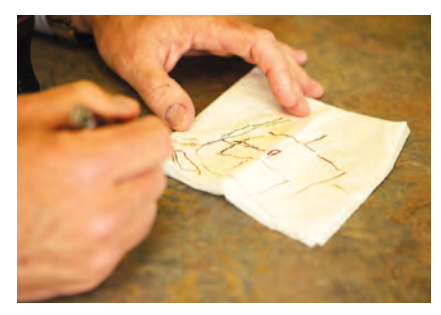
Land preservation on a napkin

Wade has worked with D&R Greenway for over 15 years. A passionate advocate for preservation as a smart investment, Wade became