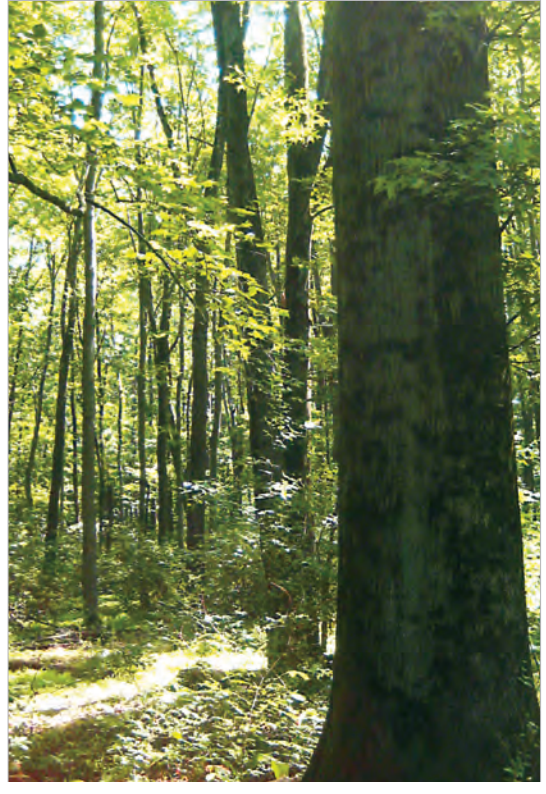
Majestic trees line the trails in Omick Woods at Rocktown Woods Preserve

A behind-the-scenes tour of our nursery and native plant gardens, with plants available for purchase.