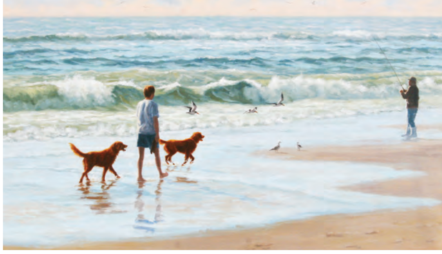
"A Perfect Morning," by Beth Parcell Evans

Out of 400 submissions, chosen multimedia art is displayed. This juried exhibit celebrates D&R Greenway's founding mission: the protection of water.