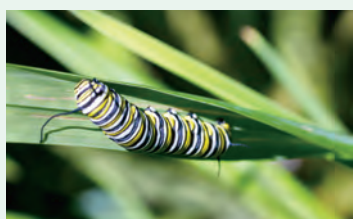
Monarch caterpillar on milkweed.

Responsible growth means leaving good things in its wake. D&R Greenway leaves pristine land for generations to come, setting the stage for the next generation of scientists, artists and land lovers. 🌱