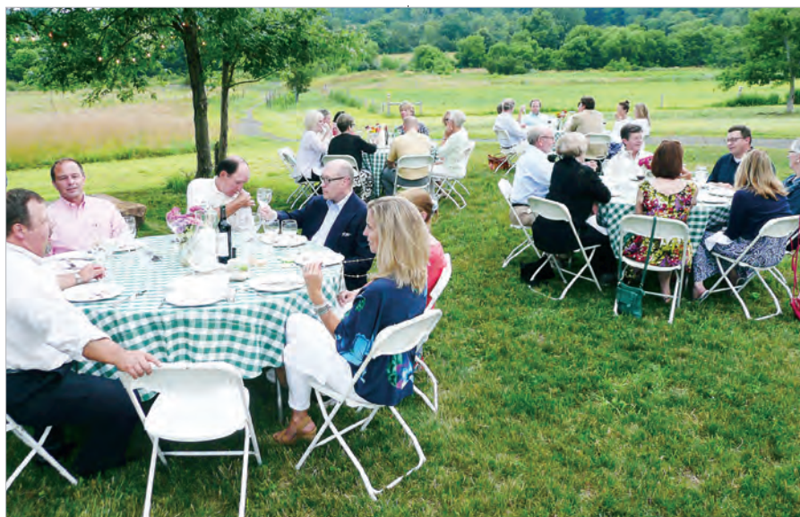
Enjoying the unspoiled view at St. Michaels Farm Preserve.

Known for innovation, perseverance and its results-driven strategies, in its first quarter century D&R Greenway