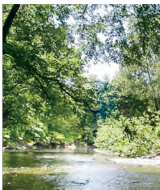
Stony Brook Creek borders Greenway Meadows.