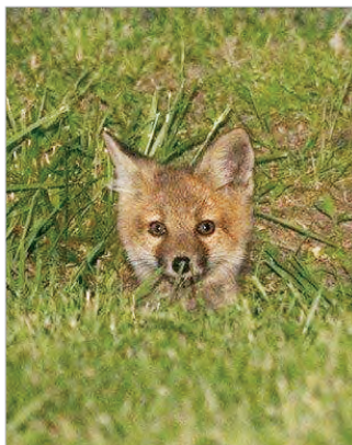
Fox kit at Baldpate Mountain.