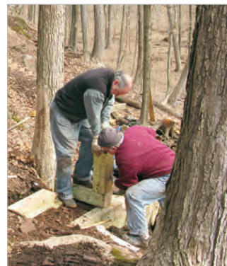
Dedicated volunteers building steps to a trail.