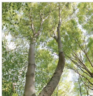
Carson Road Woods provides protected habitat for birds.