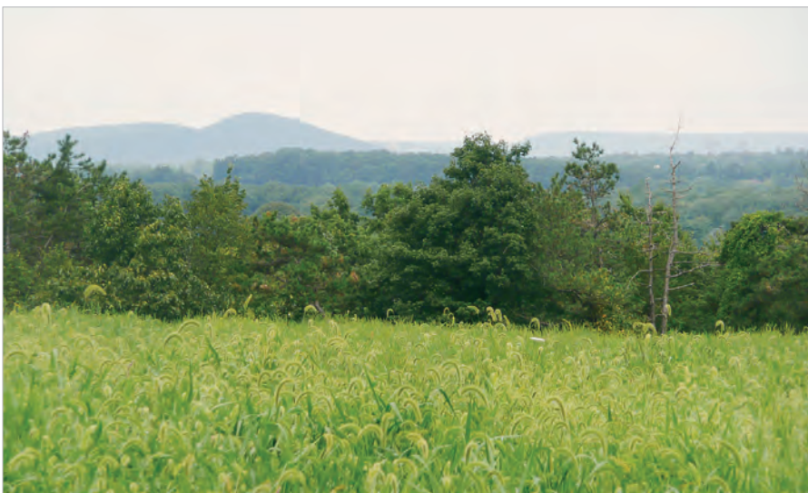
Majestic view from D&R Greenway preserved land