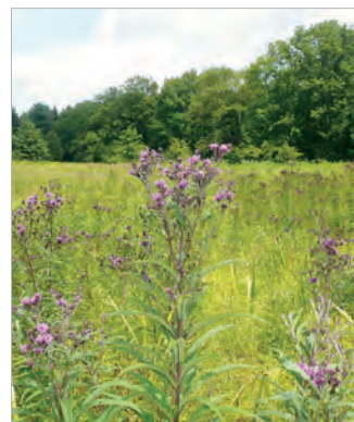
New York Ironweed thrives at Cedar Ridge Preserve.