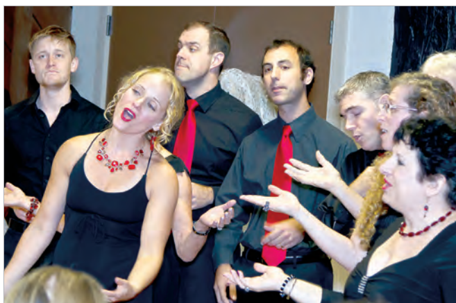
The legendary delights of the music of Jersey Transit at the annual Greenway Gala.