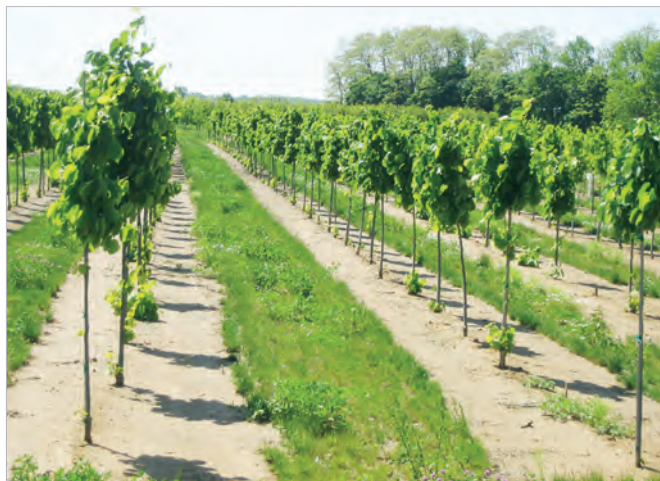
Rows of trees maturing at Princeton Nursery.