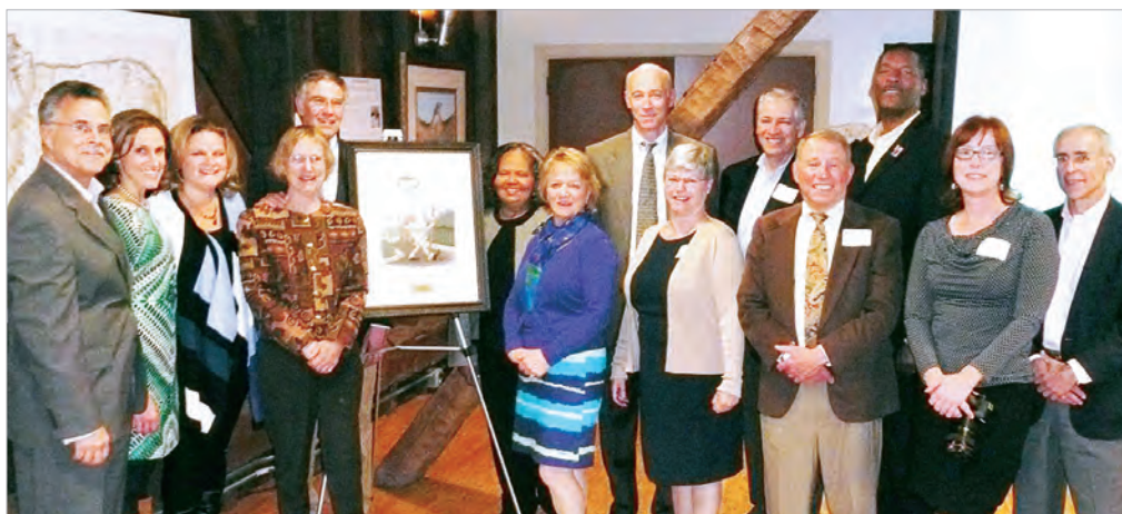
Former Congressman Rush Holt's Trailblazer Award Ceremony was held at the Johnson Education Center.