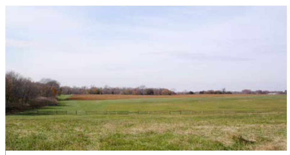
Seabrook farm field

Part of the Seabrook lands overlook the 18,593-acre area known as Mannington Meadows, bounded by the Salem River and the Mannington Creek. Historically, the Meadows were diked by Dutch settlers who farmed salt hay and wild rice. A 1920s hurricane destroyed most of the impoundments, which were never rebuilt. The resulting land and waterscape, neither a lake nor a bay, is one of the top areas in the state of New Jersey for waterfowl diversity. Mannington Meadows provides critical habitat for breeding