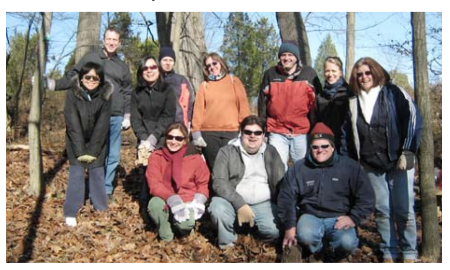
Stewardship volunteers from Educational Testing Service spend a day on the land.

Local businesses have organized work days to provide their employees with the opportunity to give back to the community while enjoying a day of camaraderie out on the land – a break from the daily office routine!