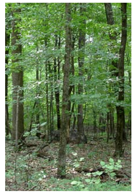
Mature woodland in the Sourlands Greenway