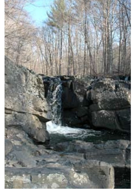
The Lockatong Creek cascades at "High Falls"

High Falls (Delaware Township, (Hunterdon County) – These 14 scenic acres of forested stream corridor were saved from development when D&R