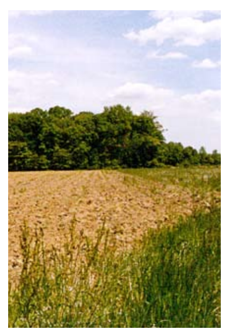
Farmland in the Rocky Brook Greenway

These preserved lands contribute to a healthy environment and help maintain a clean and abundant water