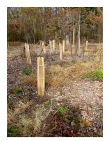
An example of native tree plantings at D&R Greenway's Cedar Ridge Preserve.