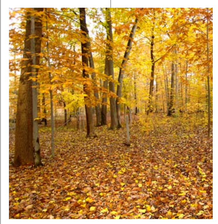
Autumn foliage decorates Beech and Oak trees on Sally and Whip Buck's preserved land in Princeton.