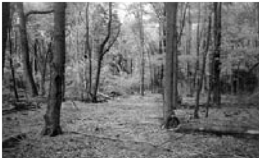
The Burgard property in West Amwell, Hunterdon County was added to the Sourland forest preserve, providing habitat for diverse wildlife

For more information on our work in the Sourlands and our sister land trust, Amigos de Calakmul, please visit www.drgreenway.org . 🌿