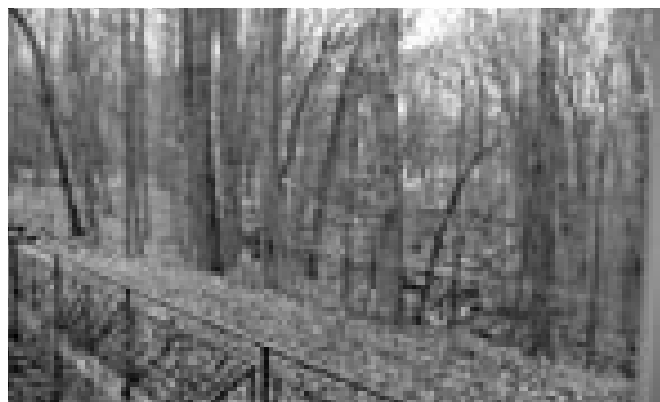
Spanning 90 acres of fields, woods, and rare native plants, the Mitchell property in Delaware Township, Hunterdon County expands the greenway along the Wickecheoke Creek