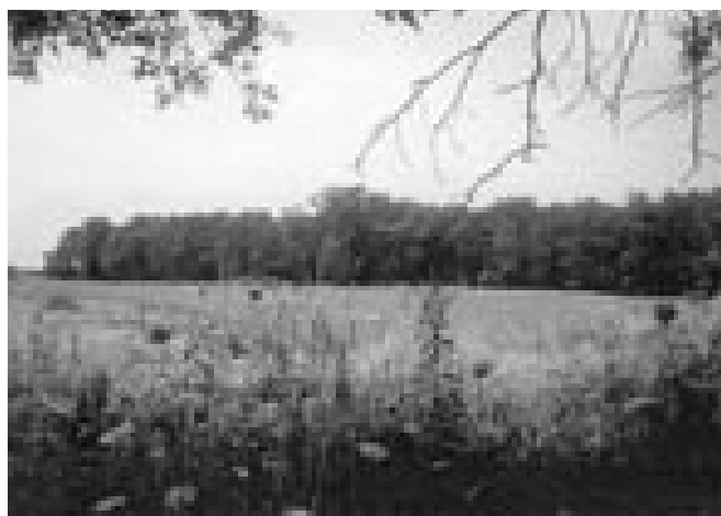
The last acquisition of 2004, the Kiesler property has been farmed for the past 50 years and creates a buffer along the Millstone River in Cranbury Township, Middlesex County