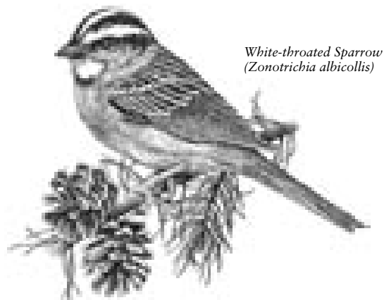
White-throated Sparrow (Zonotrichia albicollis)