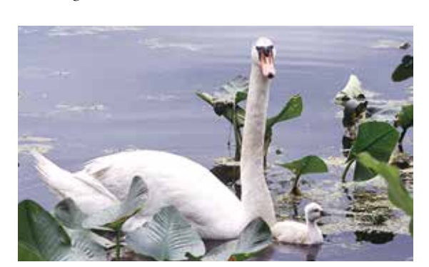
Signet Swan at the Marsh