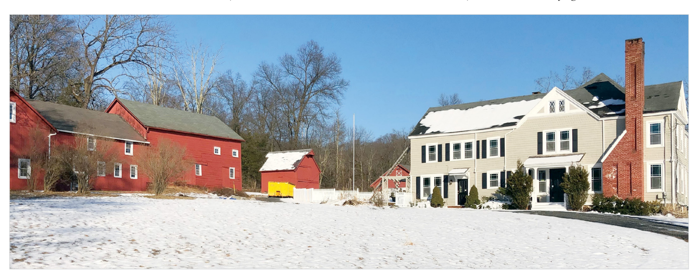
Wemple estate home and barns, ca. 1885, will remain privately owned, surrounded by the preserved historic land.