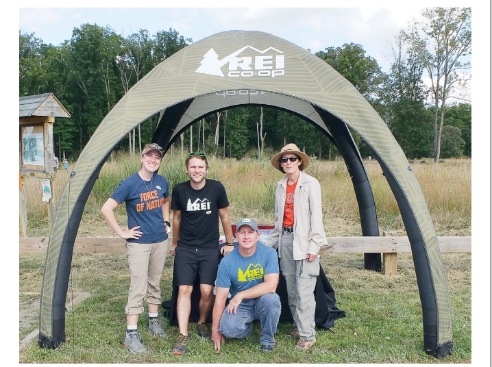
REI campout at Cedar Ridge Preserve