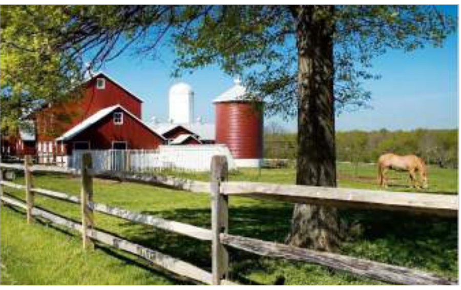
The permanently preserved Matthews family farm.