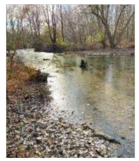
The beautiful Stony Brook Creek meanders along Cedar Ridge Preserve on newly preserved land.

Each has a story, with a past that led to a moment of decision about the future.