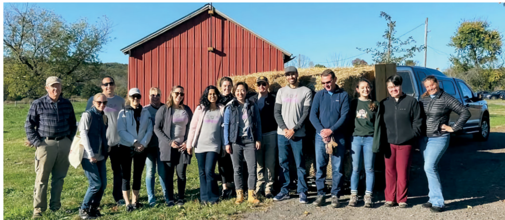
Volunteers from Bristol-Myers Squibb helped our staff prepare for our Masquerade Parade at St. Michaels Farm Preserve. It was fun to invite the public to celebrate "Birds, Bats and Bugs" with us!