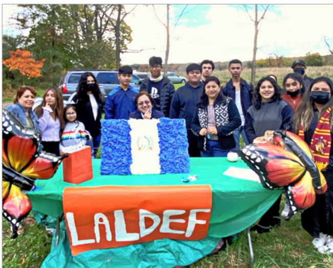
The Parade "float" by the FUTURO Program at LALDEF featured Monarch Butterflies as a symbol of migration, endurance, change, hope and life.