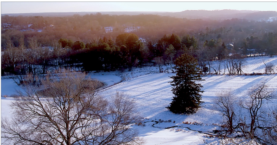
The newly-gifted land following a fresh snowfall is a truly magical place. (video capture: The Color Crew)

“We’re the Garden State. Where’s the Garden going to be one day if we don’t take care of the land? Let’s try and save as much as we can. There are lots of ways you can do it. Save your land... forever.” 🌿