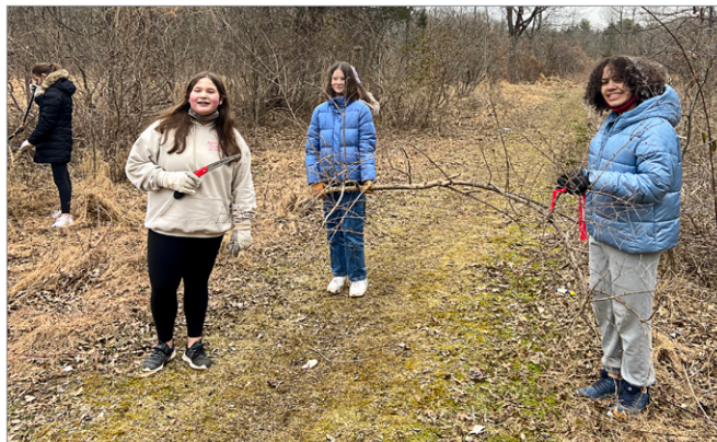
Stuart School students with youth group FaithJustice removed invasive species in preparation for a native planting on D&R Greenway's Larson Sisters Preserve. The Lawrence Hopewell Trail will extend through the soon-to-be planted wildflower meadow.