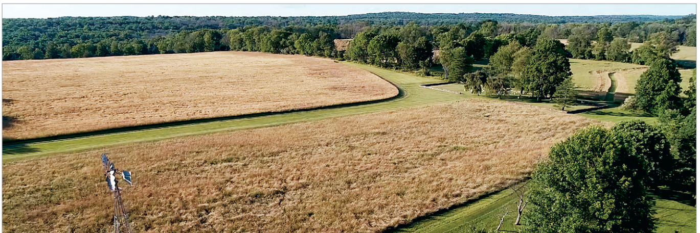
Hillside Farm includes vast farm fields that preserve the agricultural heritage of the region.

Contiguous with two other D&R Greenway preserves, the Sourland Ecosystem Preserve and popular Cedar Ridge preserve, the linkage of protected land secures migratory corridors and habitat. Running through the property is a tributary stream to the Stony Brook, a state-designated high priority waterway.