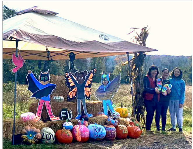
Bahai'is of Central New Jersey welcomed participants to their colorful "float" at the Parade.