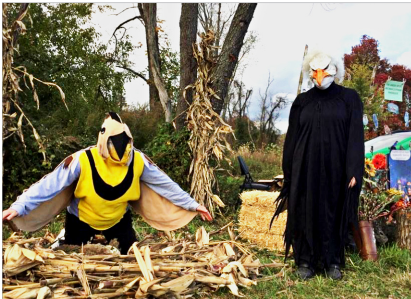
Washington Crossing Audubon Society members realistically portrayed a Bald Eagle with a chick in a nest.