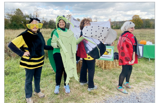
Rutgers Master Gardeners of Mercer represented the "good" and "bad" insects that are found in gardens.