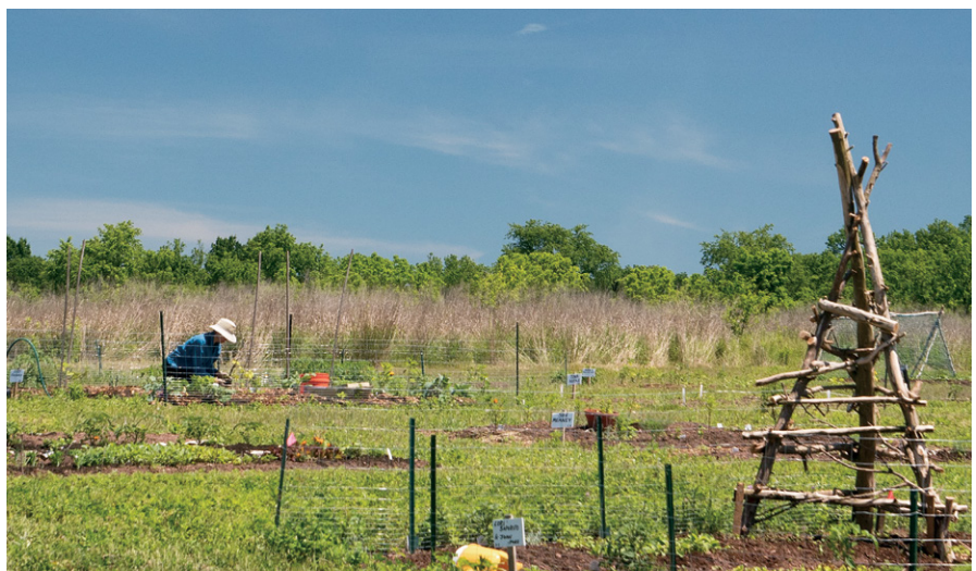
The Community Garden at St. Michaels Farm Preserve includes a Sharing Garden that donates healthy produce to people in need. We donated 1,125 of produce in 2021.

We apologize for any errors and request that corrections be brought to our attention by calling 609-578-7470 or info@drgreenway.org .