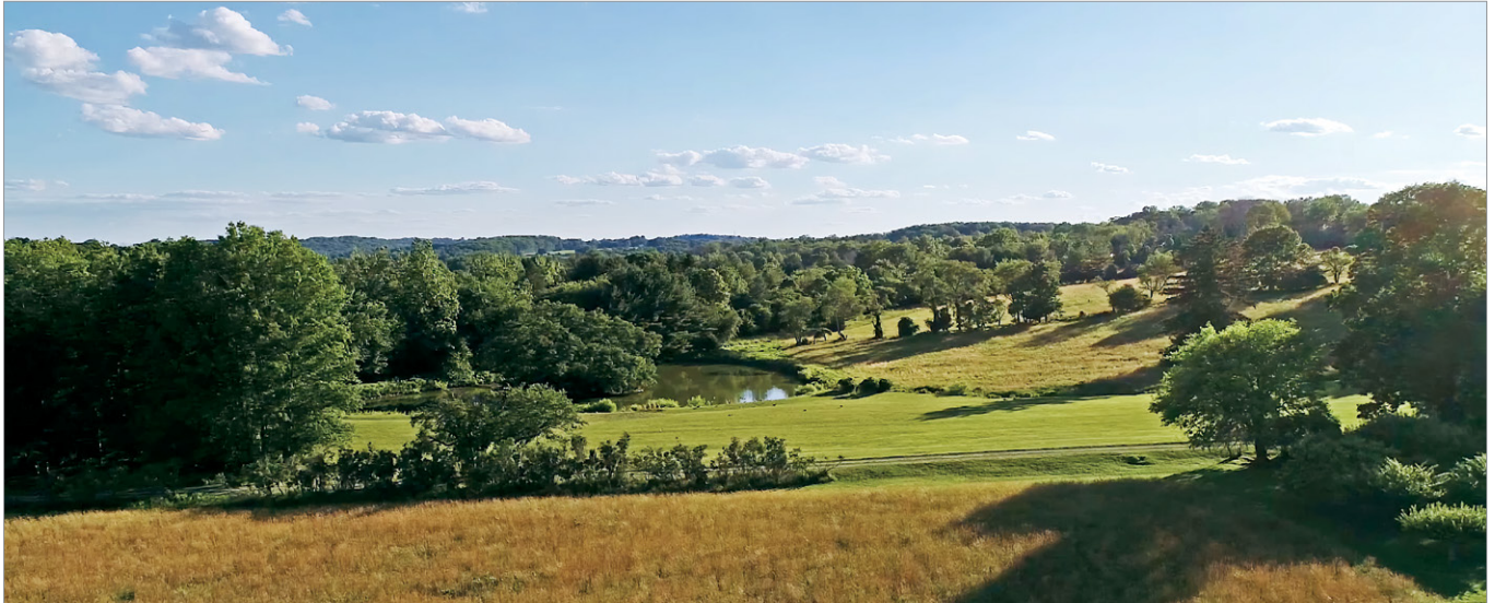
A mix of fields, forest and water features provides diverse habitat for birds and wildlife. Ecotones where land transitions between two biological communities are often richer in species than either community alone.

The land is currently closed to the public. D&R Greenway is taking a thoughtful, strategic approach to determine how best to carry out Betty’s vision for the property before opening some of the land for public access. We ask that the community is patient while we consider placement of future trails so as to protect wildlife and maintain the land’s historic and agricultural heritage.