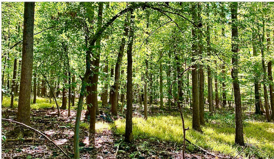
Serene Sourland Mountain forest on newly preserved land