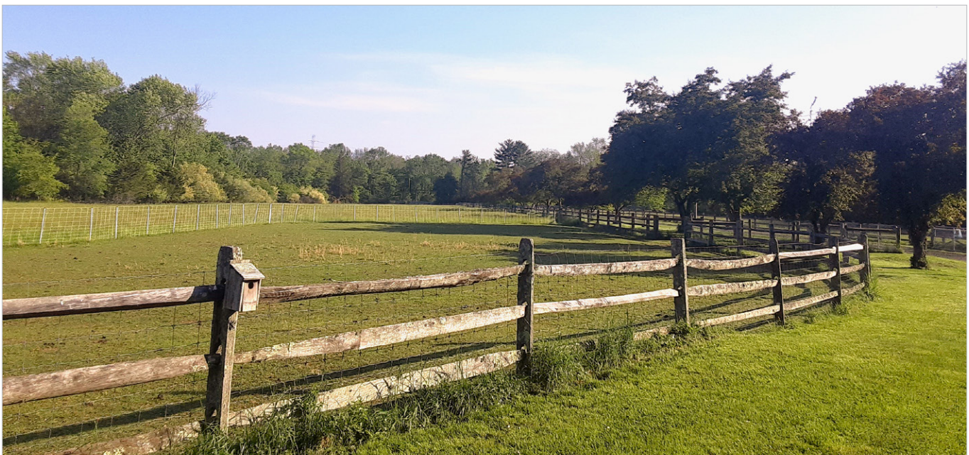
The pastoral beauty of newly preserved Carcagno Farm in the Hopewell Valley