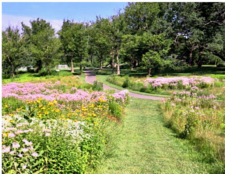
Greenway Meadows in full bloom next to the Johnson Education Center

Tickets and Sponsorships available www.drgreenway.org ~ 609-924-4646