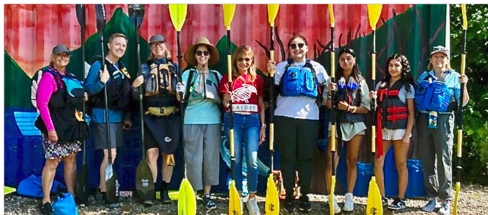
Futuro students from the Latin American Legal Defense and Education Fund learning about the Delaware River. Thanks to SPLASH for their partnership. Visit drgreenway.org for future announcements about our 2024 kayak adventures.