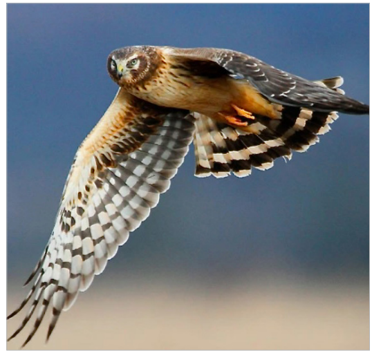
Northern Harrier