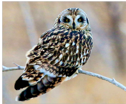
Northern Short-eared Owl