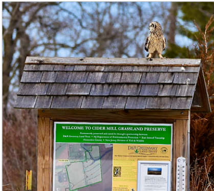
Observant Owl at Cider Mill Preserve

In 2023, Tina fortified the native grass population in the fields by overseeding native warm-season including little bluestem, big bluestem, and purpletop, using a no-till drill to pop the seeds into small holes in the soil. This technique is designed to minimize disturbance of the soil structure that is critical to a grassland habitat.