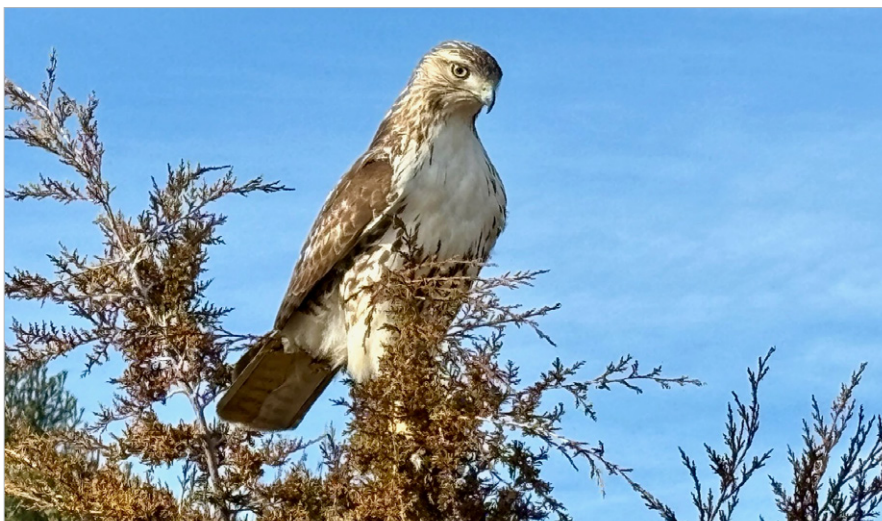
Hawk watch at Cider Mill Preserve

Both birds require large tracts—at least 20 acres—of undisturbed grasslands for foraging. Although they can share the same habitat, it is an uneasy co-existence, because they compete for the same prey—albeit at different times of day. If the owls are disturbed during daylight hours the harriers may even attack them.