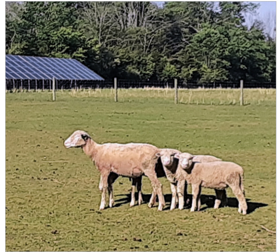
The Carcagno’s flock of domestic sheep

The footpath rambles through a mature oak-tulip tree-beech forest that shades the rocky slope. It dips gently to cross two small brooks, climbs up the south side of the valley, then pops out of the woods to open onto a light-filled vista of Hopewell Valley farmland. The farm is protected by D&R Greenway’s easement on the Cifelli property. The trail goes east along the farm field’s perimeter. In the future, it will