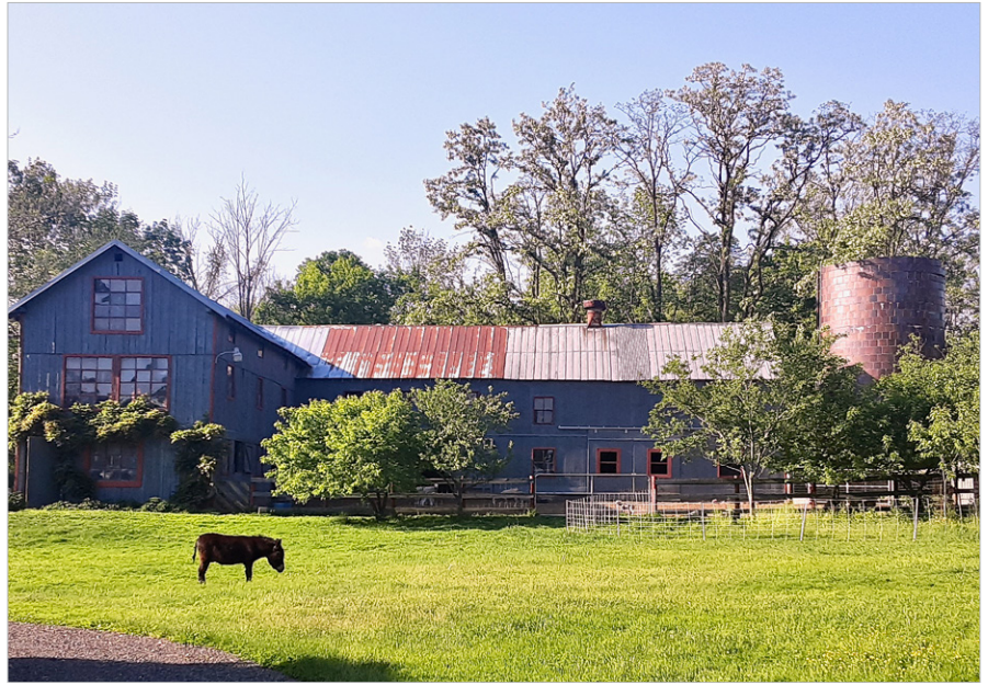
A donkey in front of the sheep barn at the Carcagno farm

The brand-new trail, completed in early 2024 thanks to the leadership of Alan Hershey and New Jersey Trails, a volunteer trail-building program of