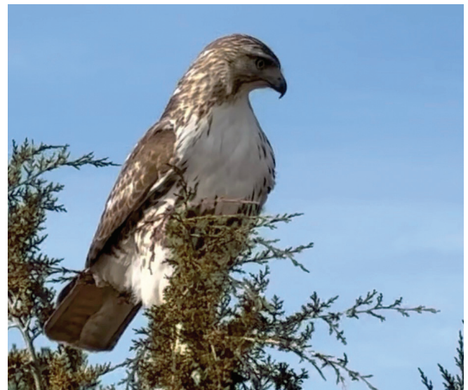
Red-tailed Hawk on D&R Greenway preserved land.