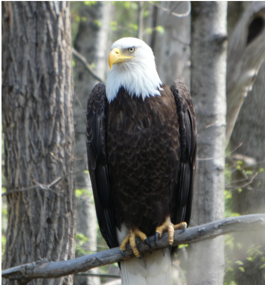
Bald Eagle recently observed near the Stony Brook in Princeton.