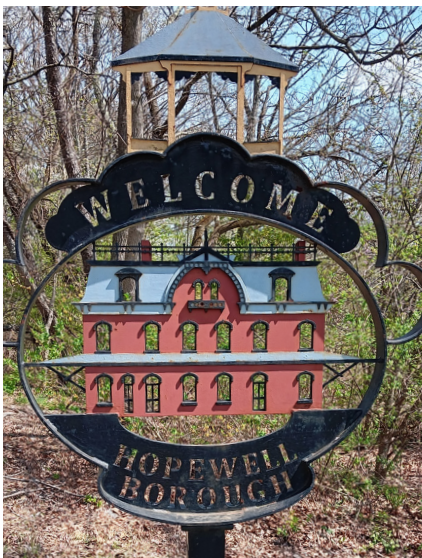
Unique signage marks the edge of Hopewell Borough next to the Hoge family farm that protects the western gateway into town.