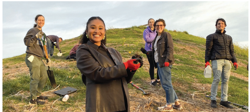
Climate Central employees help plant native wildflowers on D&R Greenway preserved land.