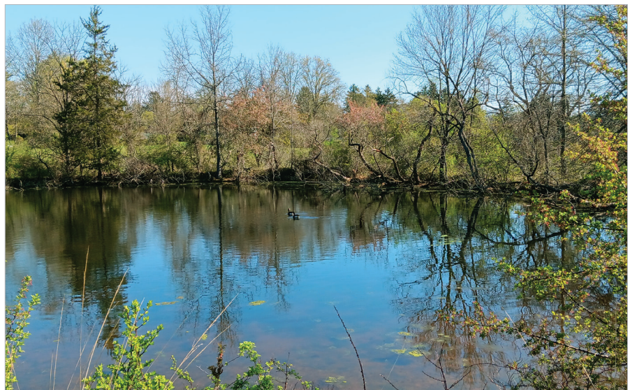
A sunny spring day shows off the beauty of the farm pond as a great place for ducks!